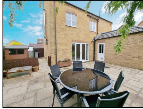
Further Garden Photos