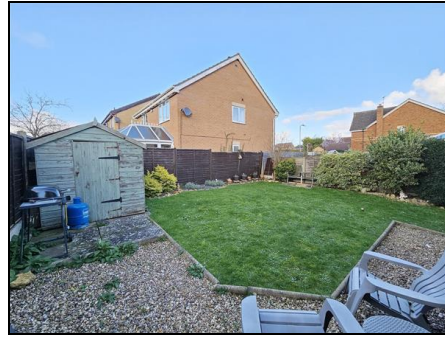
Further Garden Aspect